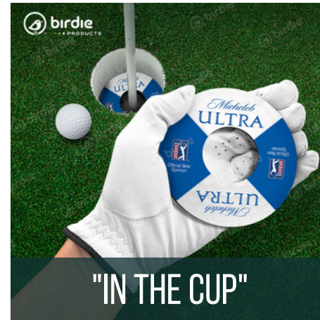
"IN THE CUP"