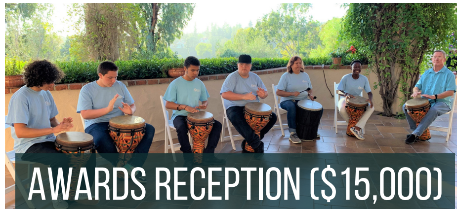
AWARDS RECEPTION ($15,000)