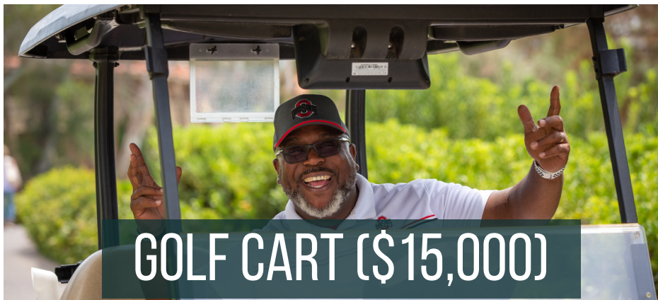
GOLF CART ($15,000)