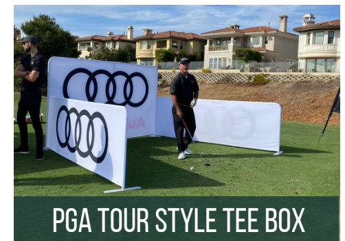
PGA TOUR STYLE TEE BOX