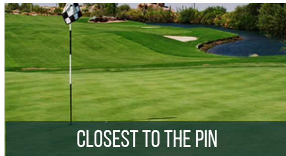
CLOSEST TO THE PIN