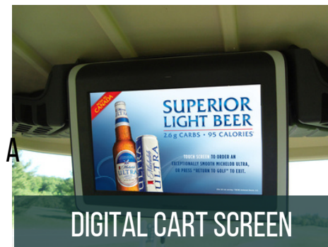
DIGITAL CART SCREEN