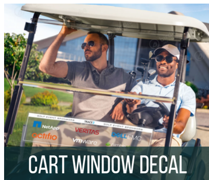
CART WINDOW DECAL